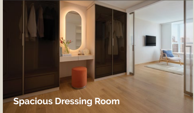
Spacious Dressing Room