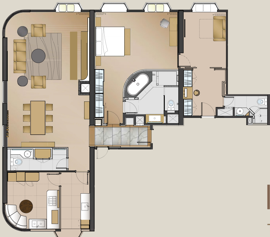
Floor Plan 1,900 sq. ft